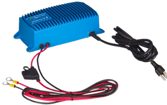
Blue Smart IP67 Charger 12/25